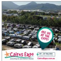
Social Media Post 1