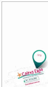
Social Media Story Template