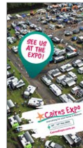
Social Media Story