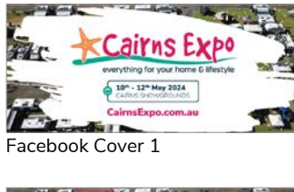
Facebook Cover 1