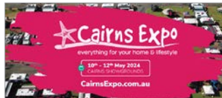
Facebook Cover 3