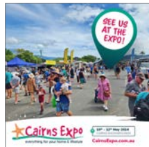
Social Media Post 2