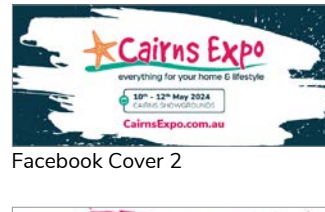
Facebook Cover 2