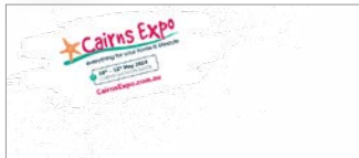
Facebook Cover Template 1