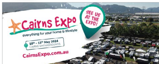
Email Signature 1