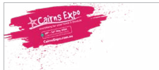
Facebook Cover Template 2