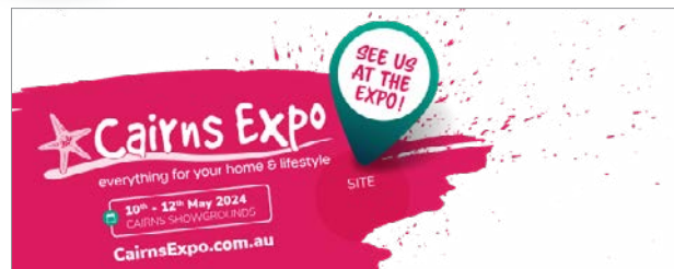
Email Signature Template 1