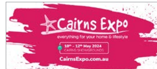
Facebook Cover 4