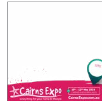
Social Media Post Template 2