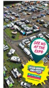
Social Media Story