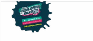
Facebook Cover Template 1