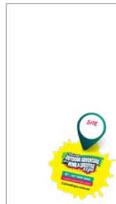
Social Media Story Template