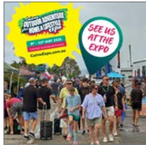
Social Media Post 2