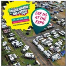
Social Media Post 1