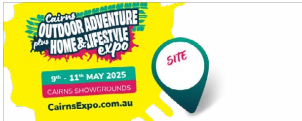
Email Signature Template 1