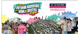
Facebook Cover 1