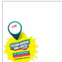
Social Media Post Template 1