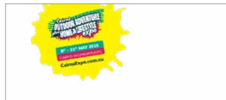
Facebook Cover Template 2