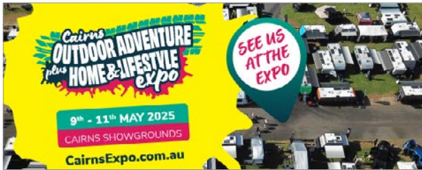
Email Signature 1