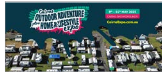
Facebook Cover 2